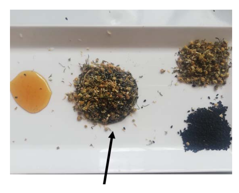
Figure 3. A single TaibUVID nutritional dose includes: 1 small spoonful (tea spoonful) of nigella sativa oil (or 2 grams nigella sativa seeds) mixed with 1 gram of grinded anthemis hyalina (chamomile) and 1 large spoonful of natural honey. This mixture is to be chewed orally