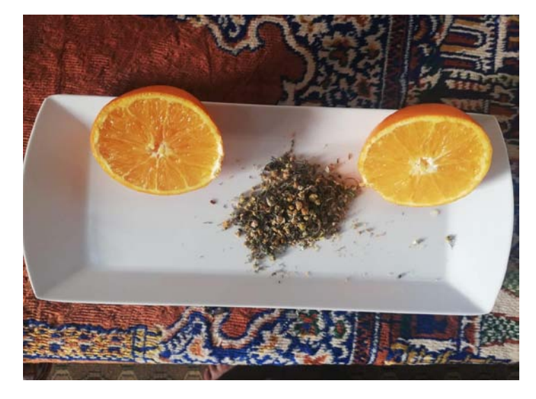
Figure 2. Anthemis hyalina (chamomile) and citrus sinensis (sweet orange) inhibit corona viruses replication