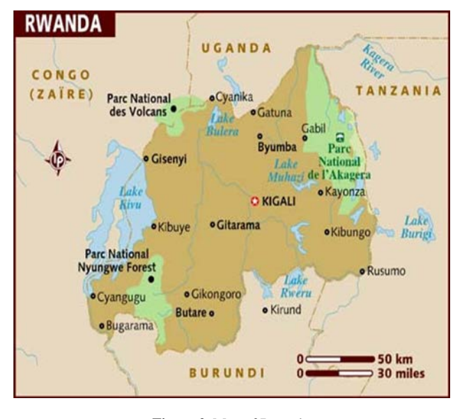
Figure 2. Map of Rwanda

Minerals in 2007 accounted for 35.9% of export earnings, followed by tourism, tea and coffee, and pyrethrum (whose extract is used in insect repellent). Mountain gorillas and other upscale eco-tourism venues are increasingly important sources of tourism revenue [2,9,10,11].